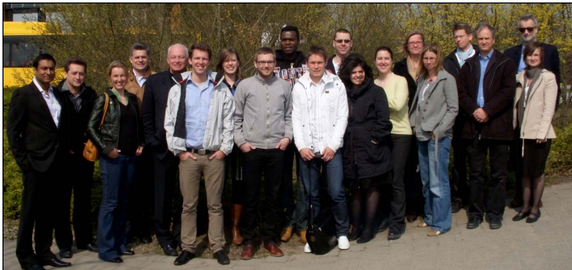
Photo: The majority of the doctoral students and senior researchers gathered during one of the first doctoral course seminars at Lund University, Spring 2009.